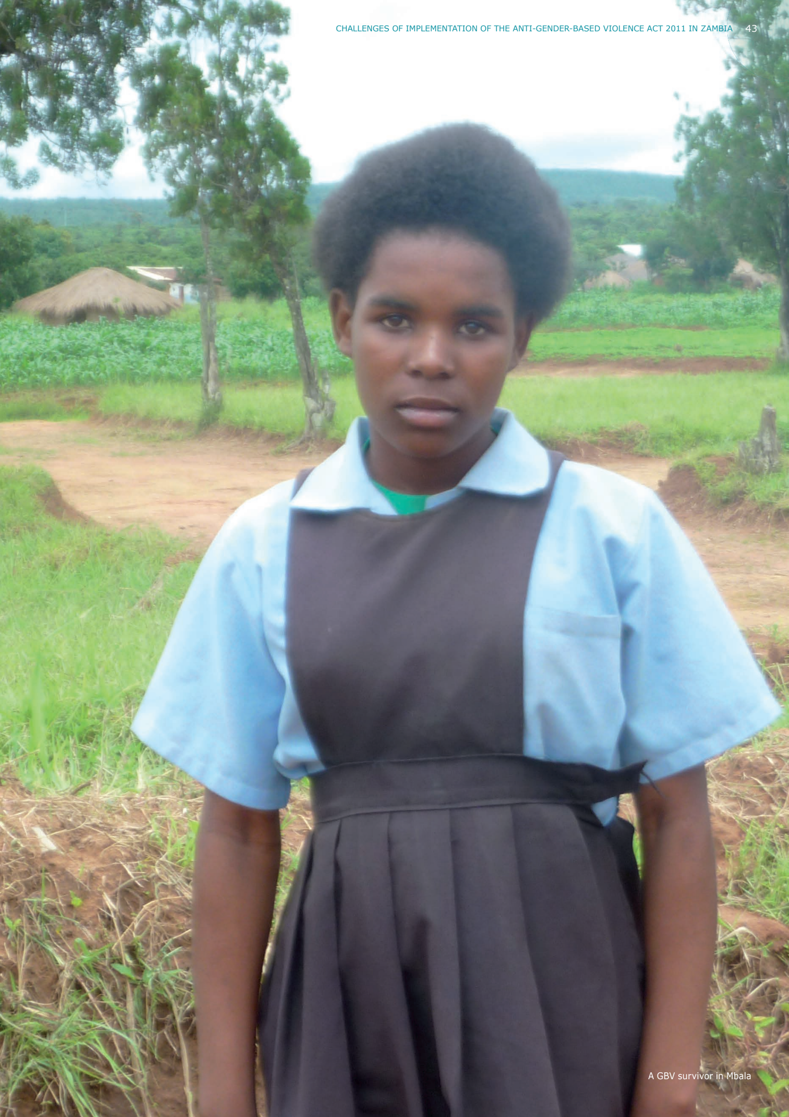
A GBV survivor in Mbala