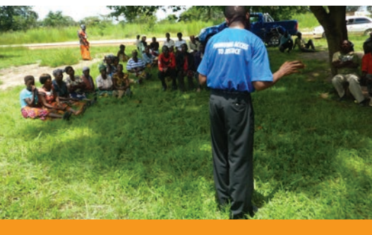
Sensitisation session in Kasama

The paralegals have noted a direct link between the sensitisation activities and increase in the number of survivors who reach out for help. Information on the services available is typically discussed amongst the women during their community socialisation activities, around bore wells, when they fetch water, around market places and when the women are forced to intervene in a GBV issue. The mobile legal clinics run by paralegals in Solwezi in the Zambian compounds in Kyawama, and in Kasempa in Nkenyauna and Muselepete provide information on GBV as well as the legal and non-legal remedies that are available in different locations. For instance, in Solwezi, mobile legal information is regularly run in market places, in the compounds (slums) around the district, in the drop-in centre and in the waiting area of Kimasala Health Clinics. These mobile clinics have been successful in drawing people who have suffered GBV to seek help in the OSCs. However, these efforts are just a drop in the ocean, and there needs to be more such efforts.