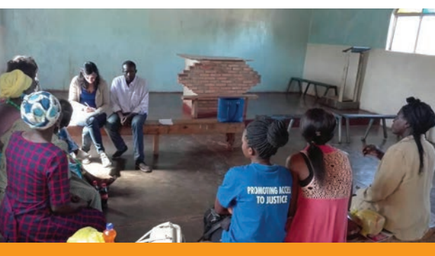
Women focus group discussion in Kasempa

In contrast, the work on GBV in Kasempa is newly established having started in 2015 with the ASF-YWCA project. The rationale for choosing this district for the study is that it is a remote, agricultural district wherein the majority of the people are farmers. Like in other parts of Zambia, the prevalence of GBV is high, with all forms of GBV reported including but not limited to defilement, rape, incest, spouse battery, child abuse and early marriages. In addition, because of the remoteness, the people in Kasempa have little access to services and resources. They are among the poorest in Zambia, with low literacy levels, and do not get the opportunity to engage with mechanisms that influence policy makers.