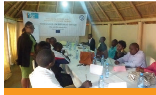
Stakeholders meeting in Kasama

It is globally acknowledged that a holistic, multi-sectorial approach is key to effective GBV interventions. While "multi-sectorial approach" is very much the buzzword in Zambia, there is little understanding on how to achieve multi-sectorial coordination and collaboration. In Kasempa and Solwezi, while there is informal engagement by different sectors working on GBV, such as referrals, this could be expanded in scope to include trainings on cross-cutting themes, and having formal agreements ensuring equitable access to resources and opportunities and services. The other areas of coordination and cooperation could be interdisciplinary expertise to data collection on GBV, establishing GBV case management structures. The Provincial and District Gender Task Force could play a key role in identifying strategic areas in which different sectors can converge and collaborate.