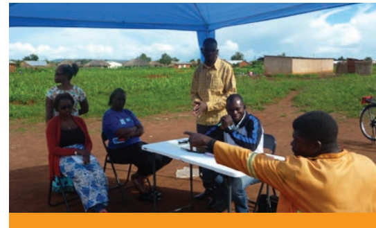
Counselling session in remote area

The cases of sexual based violence that are reported to YWCA come at a much later stage after the offence has been committed and all the negotiations in the traditional system such as the village council has failed. When YWCA reports these cases to the VSU, both the survivor and the families plead for solutions under alternative dispute resolution (ADR) mechanisms, rather than referring them to the formal justice system. Further, in most cases the perpetrator of sexual violence is a familiar person (neighbours, relatives, father, aunts and uncles), as is seen in cases related to child defilement and rape. The failure to file a complaint in these kinds of cases often results in recidivism because offenders are not held accountable or punished, and therefore are free to continue to commit these offences.