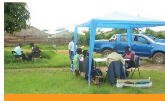
Counselling session in remote area

The Act requires counselling services to be available for survivors from expert institutions. Initially, when the GBV survivors reach out for help, YWCA or the VSU provides counselling services directly to them or refers them to the Social Welfare Department. They are the three main service providers who provide psycho-social counselling in Solwezi and Kasempa. However, the kind of counselling that is given is interchangeable with mediation and negotiation on behalf of the survivor-complainants. When there is a report of violence, especially between a husband and a wife, the service providers send a letter to the perpetrator husband who is summoned for “counselling”. If the perpetrator is remorseful, then a warning is given. If he continues to be violent, then the case would be referred to the Magistrate Court or the VSU. The survivors said that counselling to a certain extent deters a repeat of the violence. In complaints of economic abuse, after counselling and mediation the perpetrator is asked to pay maintenance or financially support the complainant. Almost all the survivors preferred YWCA counselling and mediation as it is in line with the restorative relief and justice they sought. In marital disputes where there is prevalence of modest violence, reconciliation is the standard modus operandi.