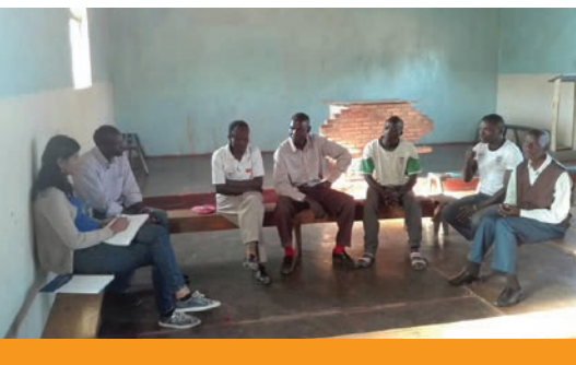
Men focus group discussion in Kasempa