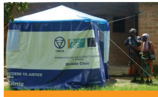
Mobile legal clinic used for sensitisation and counselling

One of the most successful community outreach programs of the VSU in Kasempa is the radio program which is broadcasted twice a week in the local language. However, there are communities in remote areas around Kasempa district who do not have radios. In Solwezi, radio programs for youth in Luvale, Lunda and Kaonde languages could be developed and broadcasted.