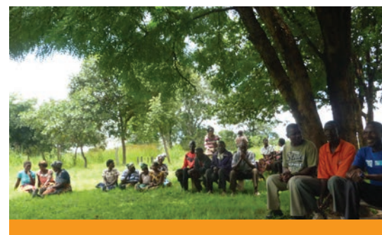
Community meeting in Kasama

Another aspect that emerged from the FGD with men in Kasempa is that GBV is often used to show the male dominance over the female. If a girl is dressed in a particular way or behaves arrogantly with a man or rejects a man, violence is used against the woman to put her in place. Witchcraft (chicondo) is also used to control women. There are many instances where women have been falsely accused and abused for practicing witchcraft or for putting a spell. When this is investigated further, invariably there is an underlying reason for which the woman was targeted. For instance, in Kasempa, a woman was falsely accused by her estranged husband of putting a curse on a family member and causing death. It was a well-known fact that the husband wanted to marry another woman. The husband mobilised the community to ram the coffin of the dead relative into the woman and kill her. GBV manifestations because of witchcraft practices are a reality for women in Zambia.