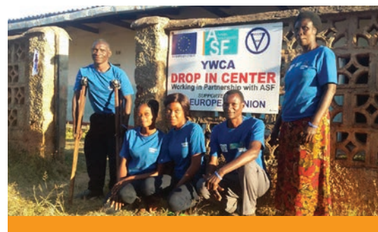
Paralegals in Kasempa

There is a critical shortage of lawyers in Zambia. As of 2015, 1,203 lawyers were registered. 46 Of these, 1,002 operate in Lusaka with only 2 lawyers registered in Solwezi and none in Kasempa. 47 The current number of practicing lawyers stands at 936 48 but the patterns of how many practitioners are in other parts of the country as opposed to Lusaka remain relatively the same. To plug the shortage of lawyers, the potential of paralegals is currently being developed to facilitate access to justice for vulnerable, poor and marginalised people. To facilitate access to justice for GBV survivors and take on complex criminal GBV offences, the paralegals need to develop important skills, have a nuanced understanding of gender constructs and improved knowledge of relevant laws including the Anti-GBV Act. This will help them to assist survivors and others affected by GBV to apply for protection orders, and support survivors through court proceedings.