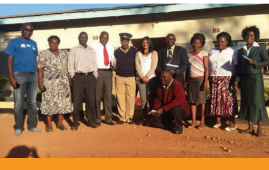
GBV Task Force in Kasempa

In practice, the Gender Task Force in Kasempa mostly convenes to discuss the quarterly reporting. During the ad hoc meeting that was convened for the purpose of this study, there was a general consensus among the focal persons of different sectors that quarterly meetings are not sufficient to move forward on GBV work. There needs to be guidelines, additional terms of reference (TORs) developed to monitor and evaluate, synergising efforts by different institutions which are reflected in the work plans of every institution. There should be agreements on formalising referral mechanisms to monitor the way GBV cases are handled in the district. 70 The members of the Gender Task Force acknowledged that they would like to have better knowledge of the provisions in the Act as well as copies of the simplified version of the Act that can be disseminated in their institutions.