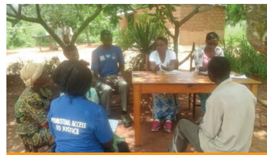
Community leaders meeting in Kasempa

Sharing their views on men and women being equal, one male FGD participant in Kasempa, remarked, "the Bible says the man was created first and then the woman. We cannot be equals. You can see from the work men and women do. When I worked in the mines in Solwezi, certain mining machines are operated only by men; women are not allowed. If we were equals, we all would be allowed to do the same type of work. But this is not the case" .