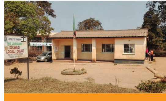
Solwezi local court

According to the Anti-GBV Act, a protection order may be applied by either the person facing violence, or on their behalf. The person applying is the «Applicant» and the person against whom the order is obtained is called the «Respondent». The various options under the protection order is that the court may order that the Respondent (i) stays away from the Applicant and/or puts conditions and specifications on approaching the Applicant or near the places that is frequented by the Applicant (ii) to seek counselling and rehabilitation (iii) to surrender any weapon that he/she maybe in possession of (iv) to continue with the payments or provide for maintenance of the Applicant. The protection orders may be amended or cancelled if the court considers the circumstances are changed. An interim protection order may be obtained upon determination of the final order. The duration of a final protection order should not exceed more than 12 months but can be extended if there is persistent threat of the violence recurring. If a respondent breaches a protection order, the person breaching will be liable to imprisonment for a period not exceeding 2 years.